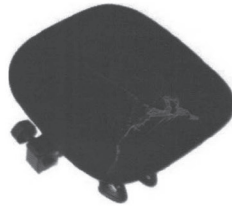
Seat with mechanism