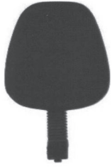
Back with bellow