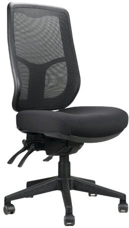
MERIDA HB BL