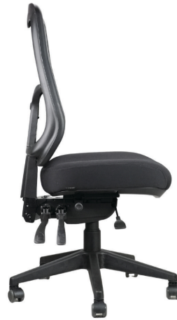
MERIDA HB BL