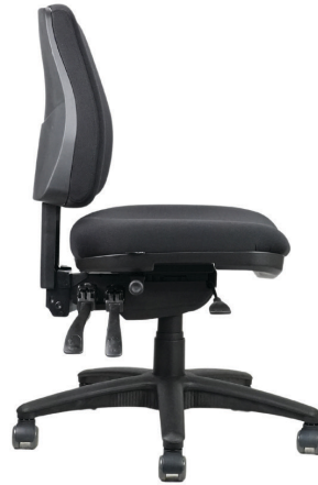
ERGO MIDI BL