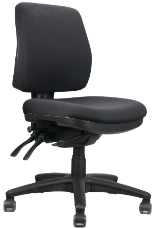
ERGO MIDI BL