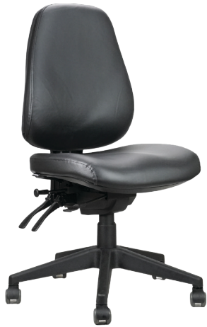
ENDEAVOUR PRO PU