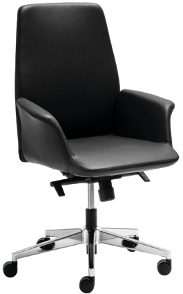
ACCORD MB GBL