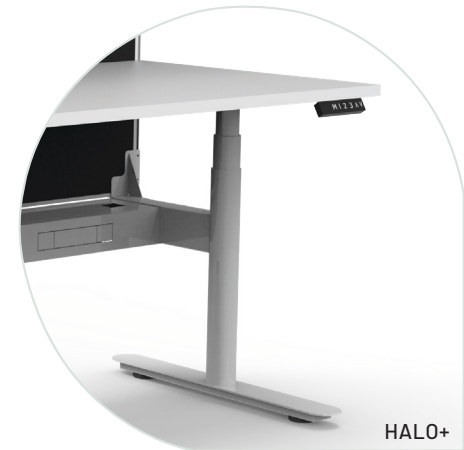
3 stage round leg