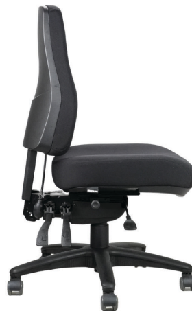
ERGO AIR BL