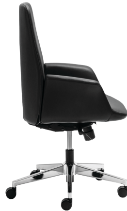
ACCORD MB GBL