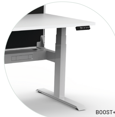
3 stage rectangular leg