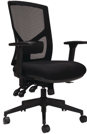
BREEZE BL + BREEZE ARMS