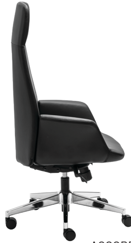
ACCORD HB GBL