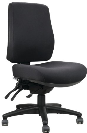
ERGO AIR BL