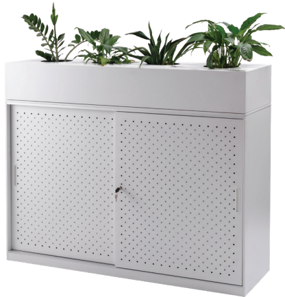
PSDC1015 WC + PB1500 WC