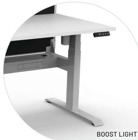
Visible single motor