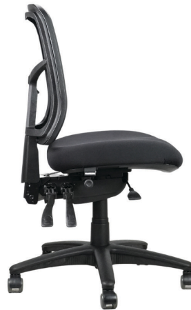
MIRAE MB BL