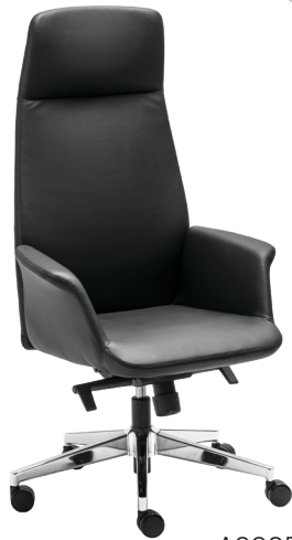
ACCORD HB GBL