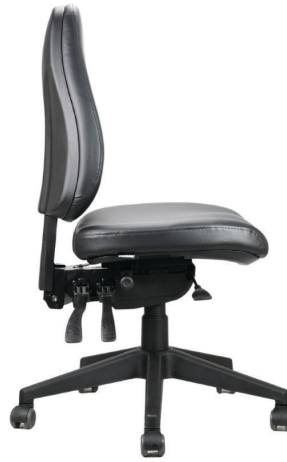
ENDEAVOUR PRO PU