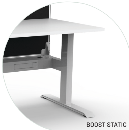
Single column leg