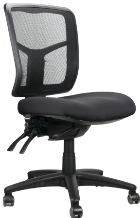
MIRAE MB BL