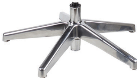
ST SPIDER BASE