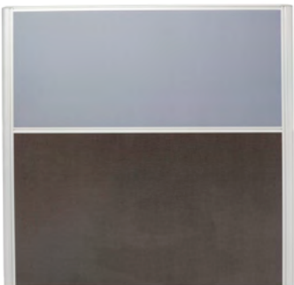
1250H Screen - Grey