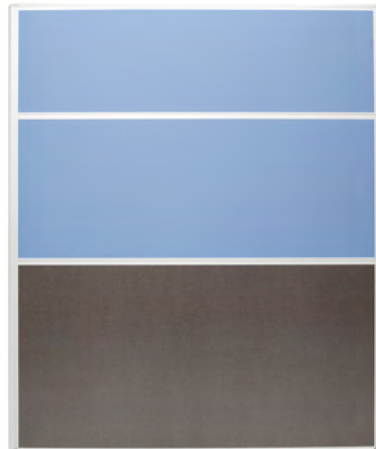
1650H Screen - Blue