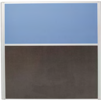
1250H Screen - Blue