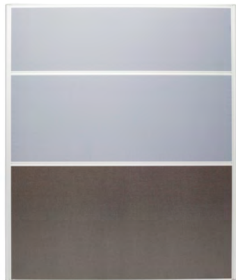
1650H Screen - Grey